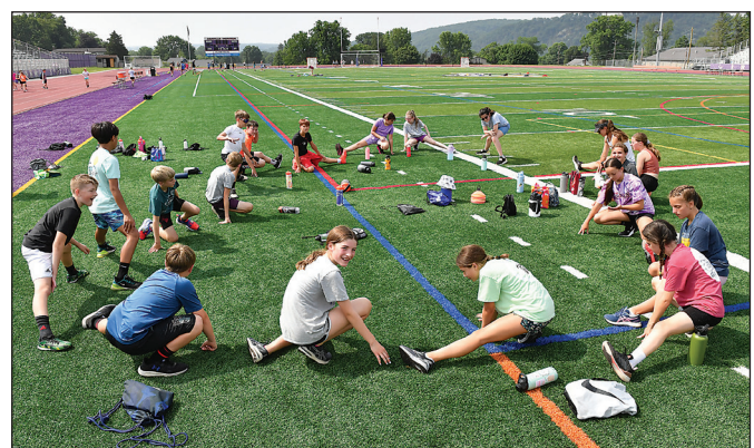
The group of sixth grade students stretch before heading to the long jump. The participants got to take part in field events as well as running events.